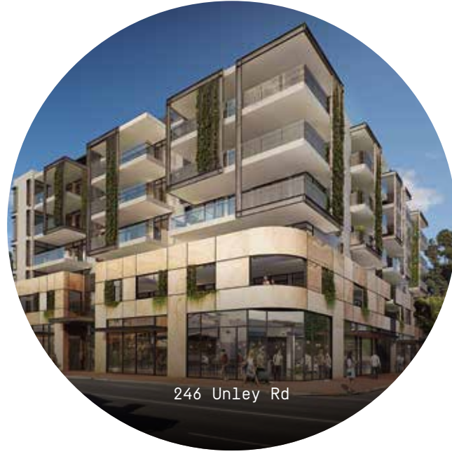
246 Unley Rd

From multi-storey mixed-use residential developments, to the construction of state-of-the-art industrial warehouses and prominent shopping centre redevelopments, Buildtec has successfully delivered major design and construction projects in Adelaide to the value of more than $500 million for private sector, not-for-profit, and government clients.