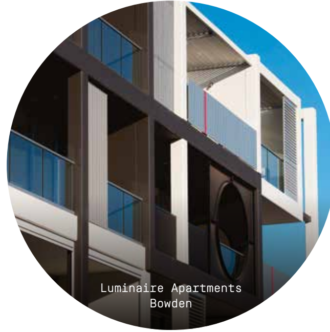
Luminaire Apartments Bowden

Catcorp is a team with over 20 years of experience spanning the entire development sector. The company's understanding of the intricacies of multiple facets of property development, design and construction, together with a strong attention to detail has been a key aspect of the company's success. Their combined talents and expertise have won a multitude of industry accolades, including the highly-coveted Environmental Sustainability, Project of the Year and Multi Residential awards.